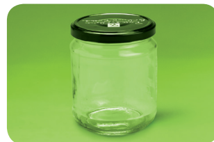
Glass food and beverage containers