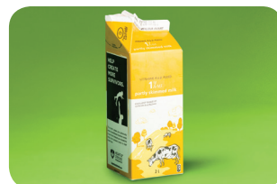
Gable top containers