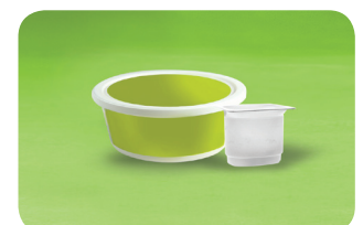
#4, #5 and #7 plastic containers