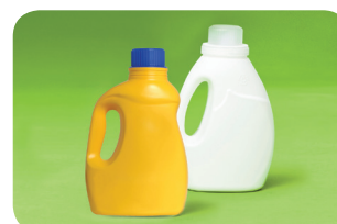
HDPE #2 plastic containers