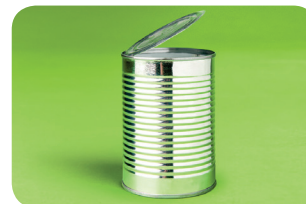
Steel food and beverage containers