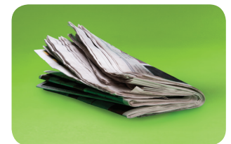
Newspapers and flyers

These are types of recyclable materials accepted in your recycling program. If you are unsure, check the Recyclepedia at SimplyRecycle.ca .