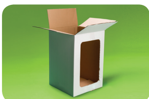
Residential corrugated cardboard