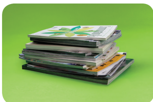
Magazines and catalogues