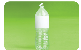
PET #1 plastic food and beverage containers