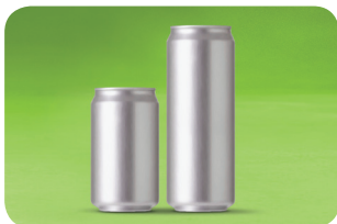
Aluminum food and beverage containers